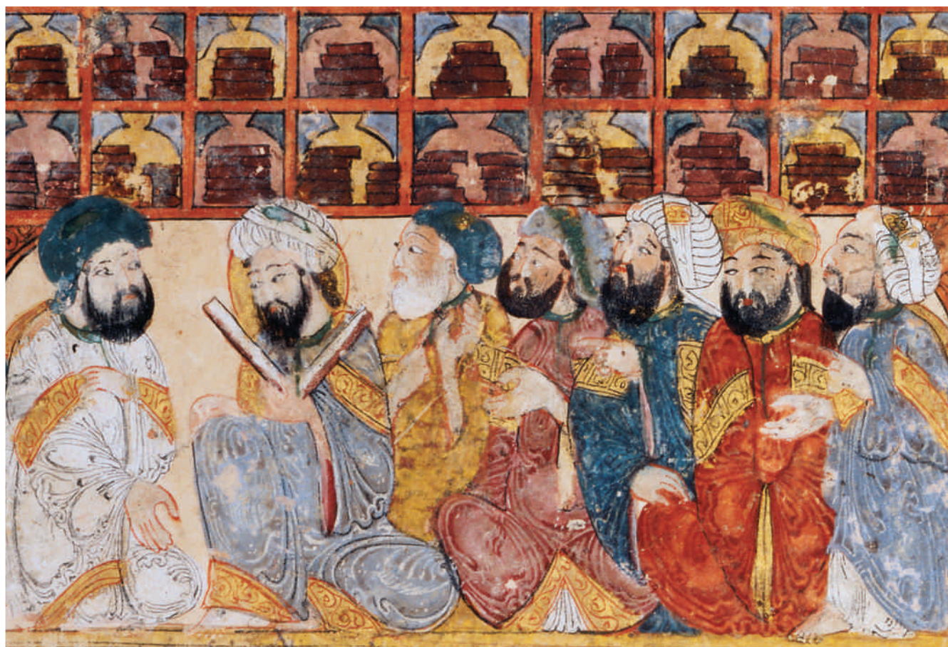
Bibliothèque nationale de France

Baghdad Bookstore With the advent of papermaking, manufacturing books became increasingly common and inexpensive. As a result, bookstores also became more common. Notice how books are shelved on their sides in wall cubicles.